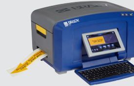
BBP®37 Sign & Label Printer $3,250