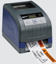
BBP®33 Label Printer $1,350