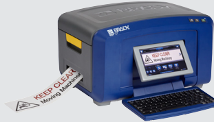
BBP®35 Sign & Label Printer $2,750