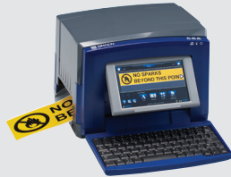
BBP®31 Sign & Label Printer $1,795