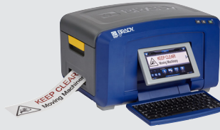
BBP®35 Sign & Label Printer $2,750