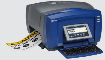
BBP®85 Label Printer $3,995