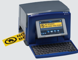
BBP®31 Sign & Label Printer $1,795