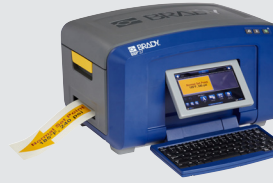
BBP®37 Sign & Label Printer $3,250